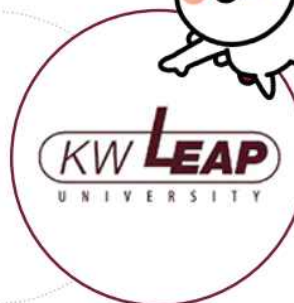
Chosen as Autonomous Contract University for the University Innovation Support Project