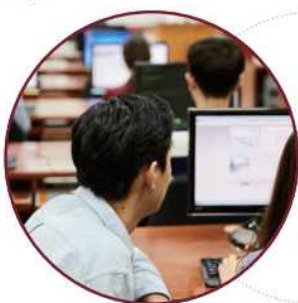
Chosen as SW-oriented University