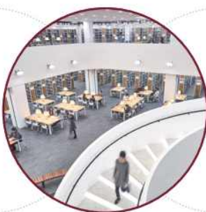
Central Library with advanced ICT technology